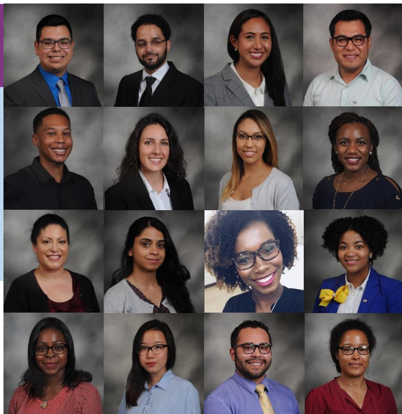
(Above) 2017 ChicagoCHEC Research Fellows & Senior Research Fellows (Left)

Students and young professionals are actively contributing to advancing the nation's goals of addressing and reducing cancer health inequities.