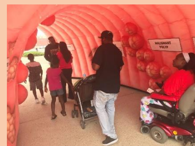
National Outreach Network Events with CECIL, 2017