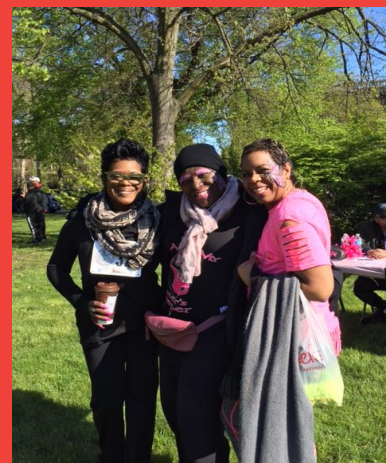
Top/Bottom: W.O.T Foundation, Butterfly Stroll Middle: ¡Vive tu Vida! Get Up! Get Going!