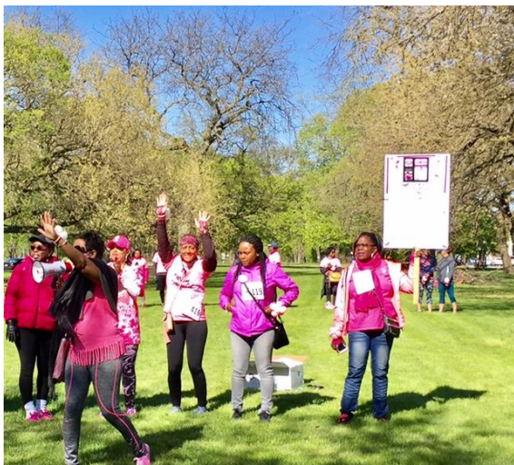
W.O.T Foundation Butterfly Stroll, 2017

If you or your organization works with underrepresented minorities who are interested in Science and Medicine – or in being a part of something larger – link them to ChicagoCHEC! We have an annual Research Fellows Program and several other opportunities for undergraduate and post-baccalaureate students.