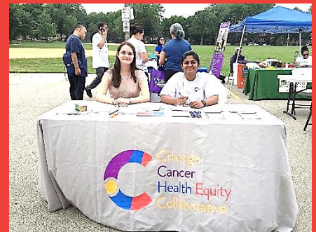
ChicagoCHEC interns at the Avondale Health Fair.