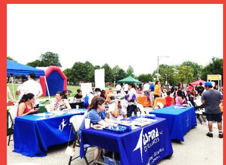
Community organizations at the Avondale Health Fair.