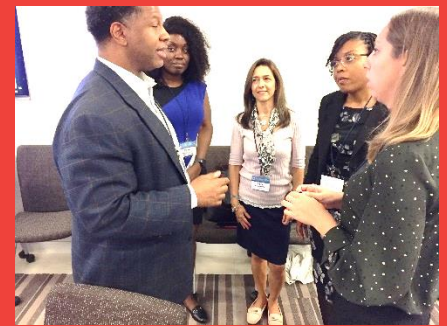
ChicagoCHEC staff at the PACHE conference in Washington, DC.