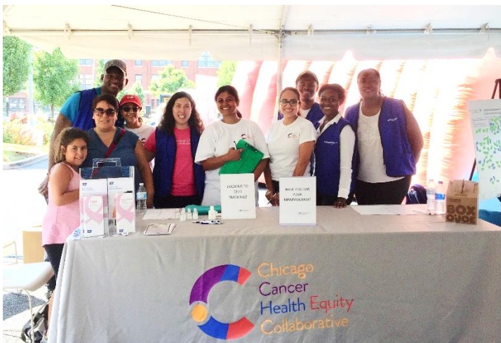
ChicagoCHEC at HopeFest in Humboldt Park, August 2018

If you or your organization works with underrepresented minorities who are interested in Science and Medicine – or in being a part of something larger – link them to ChicagoCHEC! We have an annual Research Fellows Program and several other opportunities for undergraduate and post-baccalaureate students.